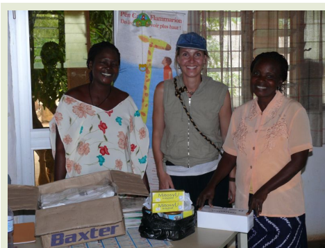
Handing over mosquito nets, food and medicines at the nutritional center - Benin

It is true that as time goes by and with the corresponding training, we are learning and try to do things better. Looking back it is very possible that we would now give certain things a different focus. Nevertheless, we believe that what is important is to learn from experience and continue to advance and work with the same degree of commitment.